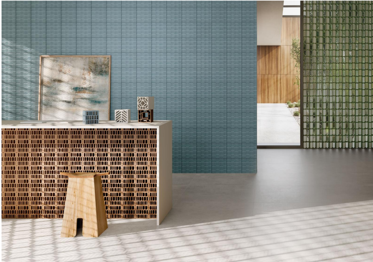
TERRAE x AMDL Circle for Mirage

The new collection, a material dialogue where light and matter intertwine in a refined design expression, will be unveiled during Clerkenwell Design Week